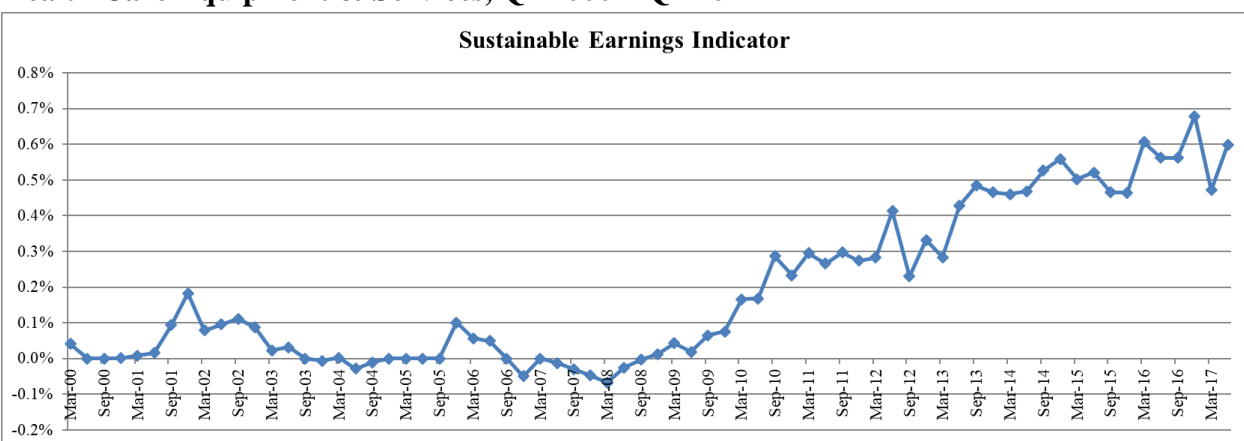
Health Care Equipment & Services, Q1 2000 – Q2 2017

Next we take a closer look at an industry with a positive and rising sustainable earnings indicator: Health Care Equipment & Services.